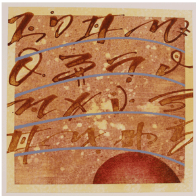
Art by: Rebecca Wild

Please take a look at the workshops below with space available.